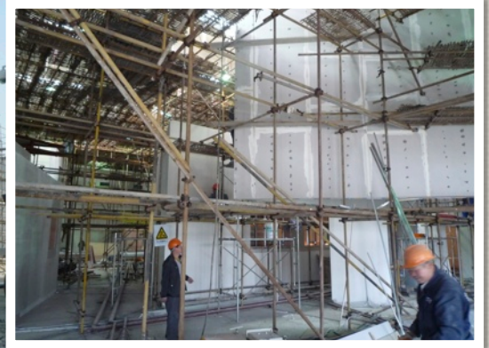
LEFT: OUTSIDE OF THE GREEK PAVILION. ABOVE: THE INTERIOR OF THE GREEK PAVILION.