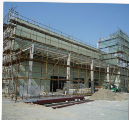
THE GREEK PAVILION